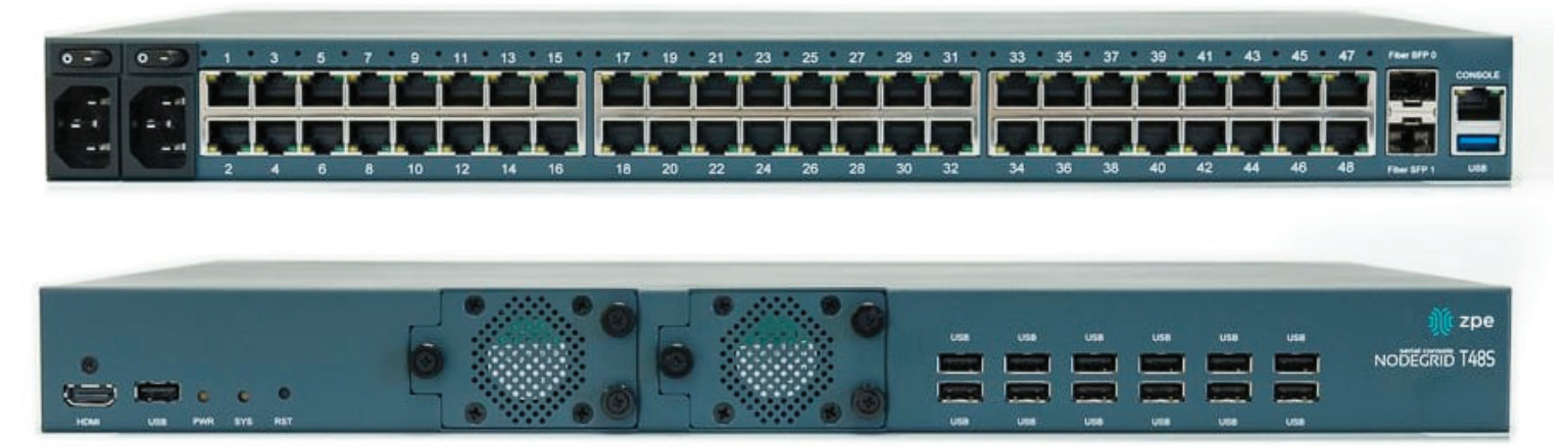
Image: The Nodegrid Serial Console features serial, ethernet, and USB ports, with an Intel processor and Linux-based OS that enable direct hosting of management software such as Nodegrid Manager.

Making their solution seamless and easy to use was the Nodegrid Serial Console (NSC). The company replaced their out-of-band devices with the NSC, which features high port counts and a powerful Intel® processor. This enabled them to connect every device in their stack to a single box — from routers and switches, to PDUs and UPS devices. The NSC was able to efficiently process every connection while serving as a secure, unified access gateway. On top of this, the onboard Nodegrid OS directly hosts Nodegrid Manager to make implementation simple.